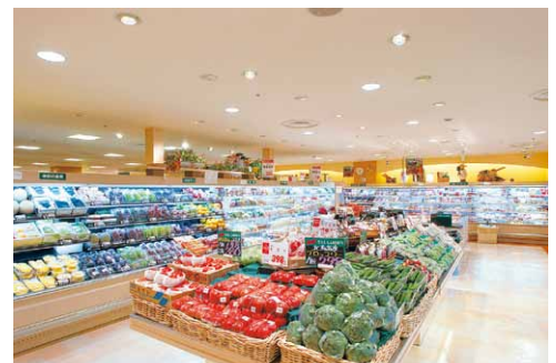
The Garden Jiyugaoka Meguro, Tokyo